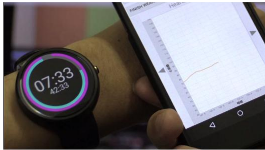
Figure 2. Wearing a smart-watch on the wrist

Figure 2 shows a user wearing the smart-watch on the wrist and running the application. The application can indicate notices such as vibration, showing messages/images on the device’s screen when the rate of heartbeat exceeds a particular value which was set in advance. When rate of the heartbeat falls, the reason is because it is thought that I am in a tense state during an angry time.