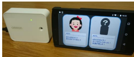
Figure 1. A face sensing sensor HVC-C (left) and a question mode screen on a smart-phone (right)

The first approach is a face-expression training game for students using the expression-sensing sensor OMRON HVC-C (Human Vision Components C1B model) and a smartphone (Figure 1). This game is a kind of quiz game. A student answers questions by making face-expression e.g. smile, angry, sad, surprise and serious. This application is able to record data which corresponds to the duration of time and rate of correct answers. After training, the screen displays face-expressions in the same sequence. Applying this approach, a person who is not only physically challenged and but also has a panic disorder will be able to send a signal or control devices.